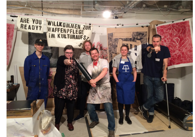
From Supermarket Independent Art Fair 2016