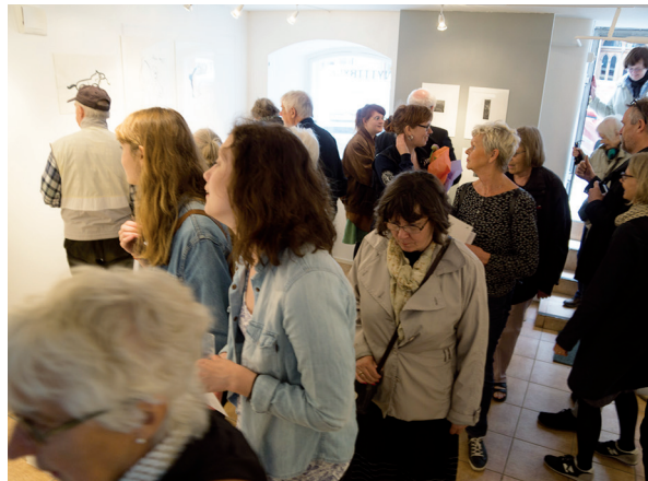
Exhibition with new members

The original group of 50 local artists from different workshops in Region Västra Götaland has now grown to about 280 national and internationally-based members. The gallery houses a collection of about 4500 printed works, where the audience meets a wide range of artistic expressions.