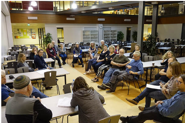
from ENDEGRA meeting in Imatra, Finland 2016

We get a co-funding through an assignment concerning cultural strategies from Region Västra Götaland.