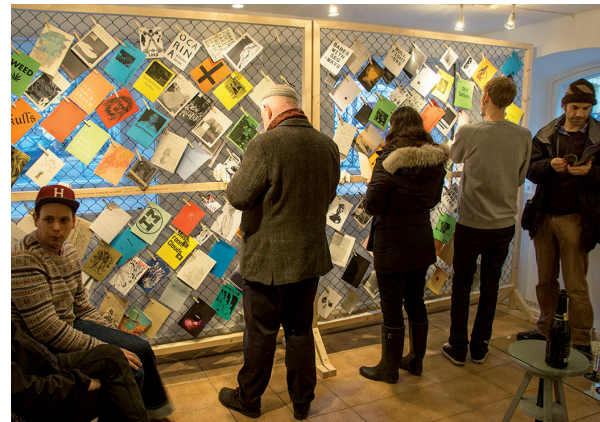
ZINES-exhibition with JARKO-collection

Grafik i Väst Storgatan 20 SE-411 38 Göteborg +46 (0)31-711 38 39 e-mail: giv@ramverk.se web: grafikivast.se facebook: grafik i väst gallery instagram: grafikivast